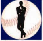
AGENT SOLD MichaelDunn.com